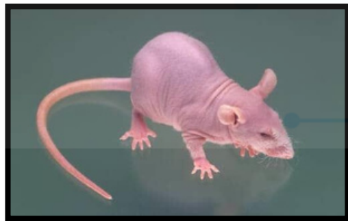
F344 Nude Rate

Several other specialized mice strains are available at CLEA Japan. Users can submit enquiries to NSI to check the availability.